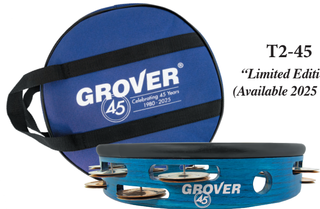
T2-45 "Limited Edition" (Available 2025 only)

To commemorate its 45th anniversary, Grover Pro is releasing a limited edition headless tambourine inspired by its renowned Studio Pro model. The tambourine features a striking sapphire shell and a unique mix of silver, bronze, and copper jingles, accompanied by a matching sapphire 45th-anniversary bag. As a special thank-you, Grover Pro will include this exclusive bag with every professional model tambourine sold throughout 2025.