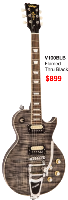
V100BLB Flamed Thru Black $899