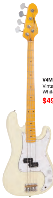
V4MVW Vintage White $499