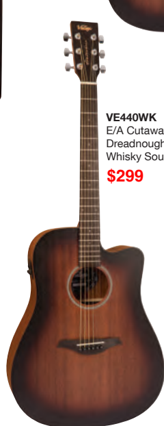
VE440WK E/A Cutaway Dreadnought Whisky Sour $299