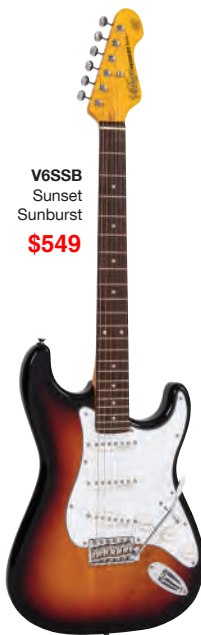
V6SSB Sunset Sunburst $549