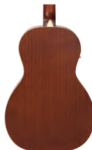
V180VSB 'Parlour' Acoustic Guitar Vintage Sunburst $299

With a lightweight mahogany-spruce construction, and an exceptionally smooth 20 fret fingerboard, the small bodied Vintage Historic Series Parlour electro-acoustic excels as a 'player', with a size-defying long-throw output and exceptional tone.