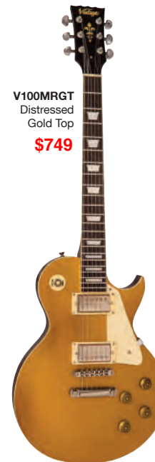
V100MRGT Distressed Gold Top $749