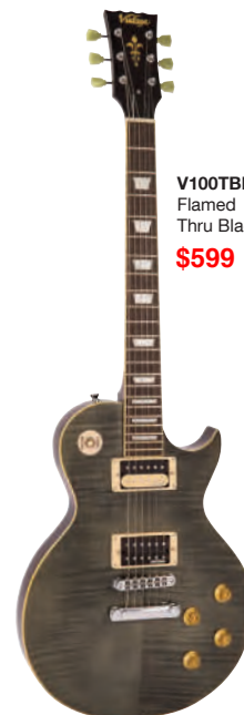
V100TBK Flamed Thru Black $599