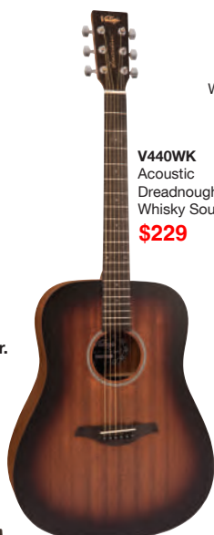
V440WK Acoustic Dreadnought Whisky Sour $229