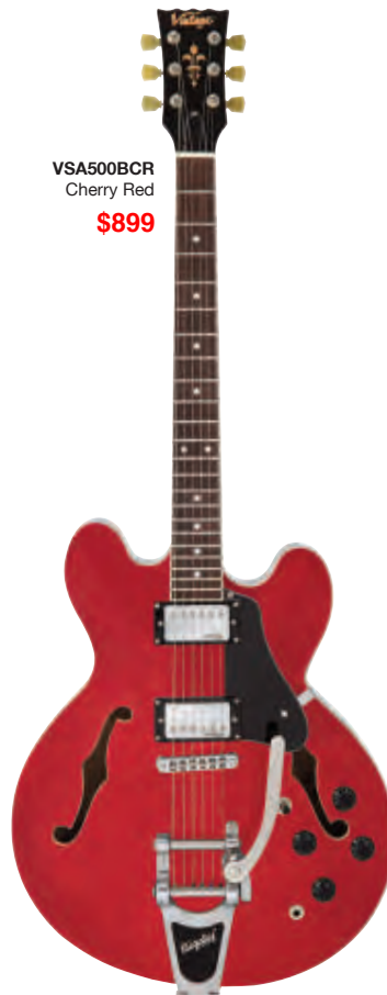
VSA500BCR Cherry Red $899