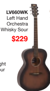
LV660WK Left Hand Orchestra Whisky Sour $229