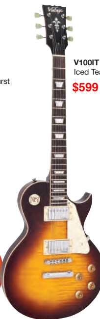
V100IT Iced Tea $599