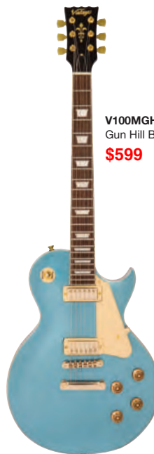
V100MGHB Gun Hill Blue $599