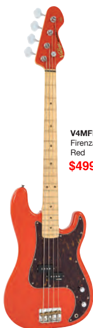
V4MFR Firenza Red $499