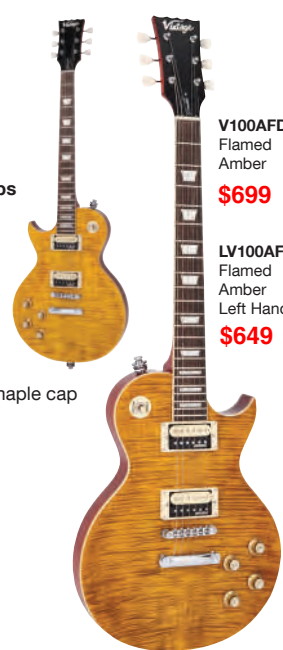
LV100AFD Flamed Amber Left Hand $649