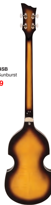
VVB4SB Antique Sunburst $699