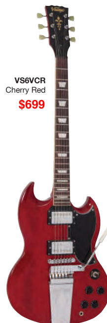
VS6VCR Cherry Red $699