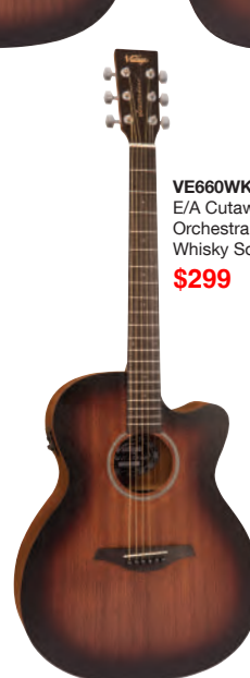
VE660WK E/A Cutaway Orchestra Whisky Sour $299