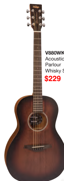
V880WK Acoustic Parlour Whisky Sour $229