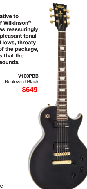
V100PBB Boulevard Black $649