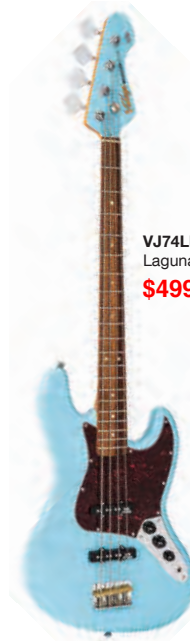
VJ74LB Laguna Blue $499