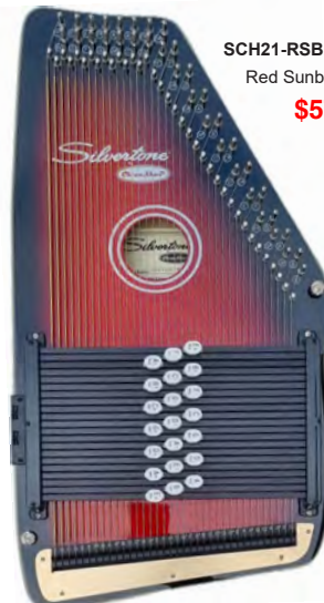
SCH21-RSB Red Sunburst