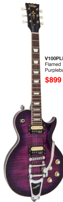
V100PLB Flamed Purpleburst $899