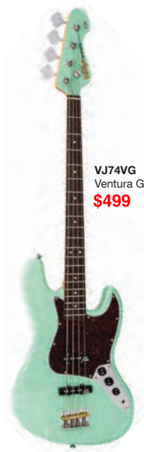
VJ74VG Ventura Green $499