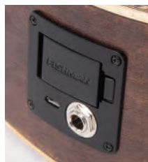
VTR800PB Acoustic Natural $499