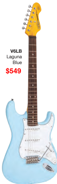
V6LB Laguna Blue $549