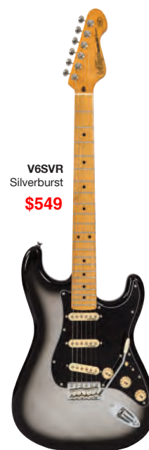
V6SVR Silverburst $549