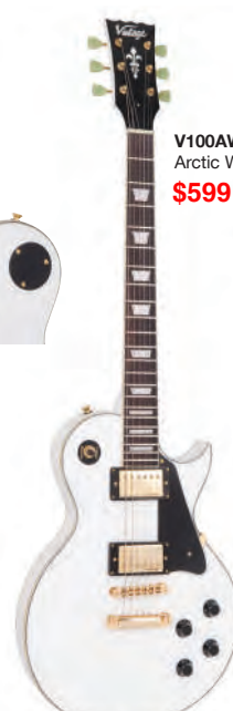
V100AW Arctic White $599