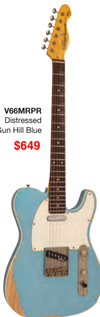
V66MRPR Distressed Gun Hill Blue $649

Whilst the cream ivory body binding remains, the original Gun Hill Blue finish, with wear and tear abrasions in all the right places, reveals areas of the USA Alder body, looking stunning, matched with authentically aged hardware that includes, Wilkinson Deluxe WJ55CR tuners and a fully adjustable Wilkinson WTBD intonatable bridge.