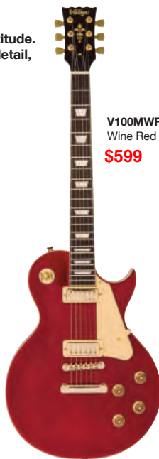
V100MWR Wine Red $599