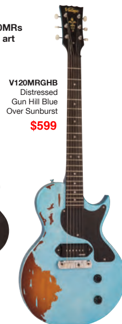
V120MRGHB Distressed Gun Hill Blue Over Sunburst $599