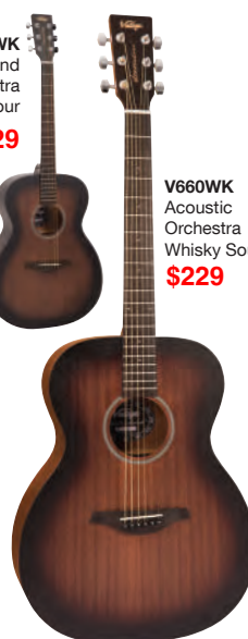
V660WK Acoustic Orchestra Whisky Sour $229