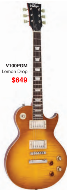
V100PGM Lemon Drop $649

The reverse-fitted neck double coil and out of phase centre position wiring created one of the most recognisable guitar sounds of the genre – real 'Black Magic'.