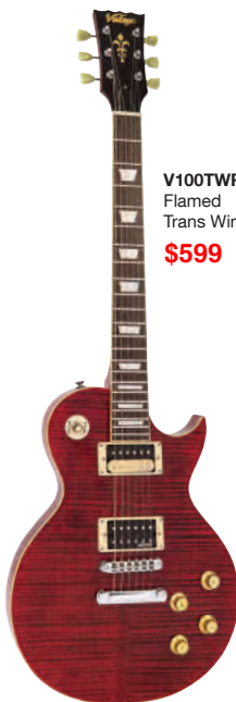
V100TWR Flamed Trans Wine Red $599