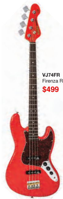
VJ74FR Firenza Red $499