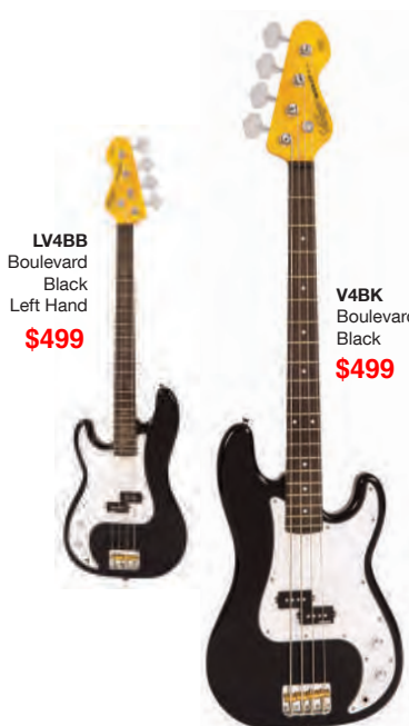
LV4BB Boulevard Black Left Hand $499

Classic split single coil tones abound with the V4 bass. Its Alder body gives a firm foundation for the Wilkinson adjustable bridge and is perfectly matched to a hard maple neck.