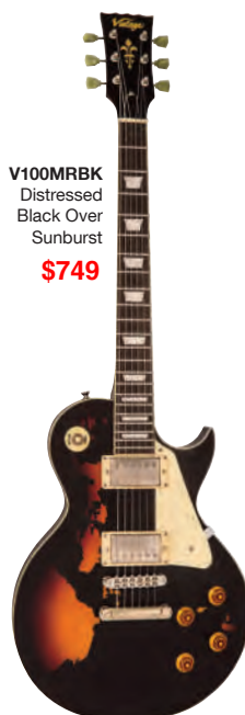
V100MRBK Distressed Black Over Sunburst $749