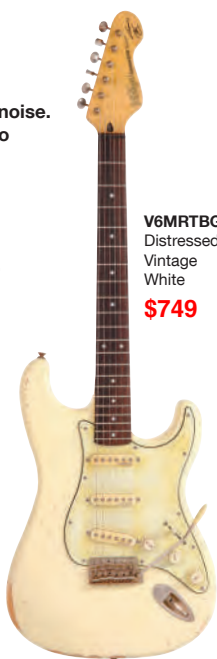
V6MRTBG Distressed Vintage White $749