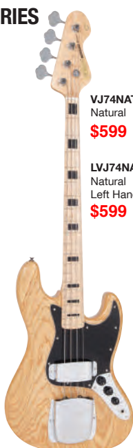
VJ74NAT Natural $599 LVJ74NAT Natural Left Hand $599