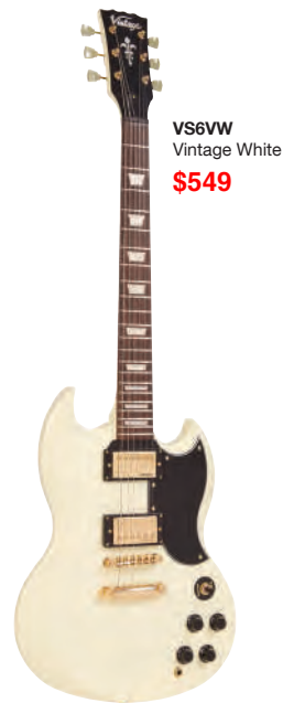
VS6VW Vintage White $549