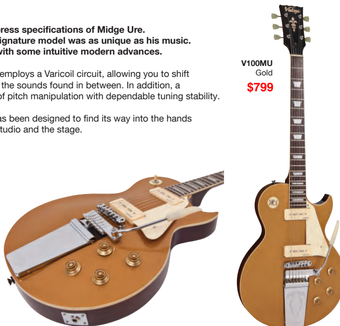
V100MU Gold $799

As well as satisfying the demands of the man himself, the V100MU has been designed to find its way into the hands of anyone seeking an adaptable and agile guitar that's ready for the studio and the stage.