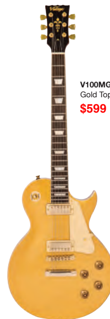
V100MGT Gold Top $599