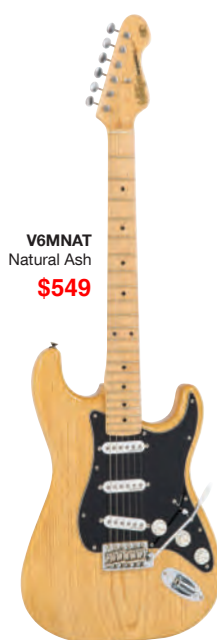
V6MNAT Natural Ash $549