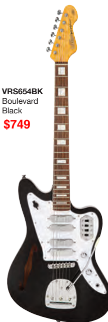
VRS654BK Boulevard Black $749