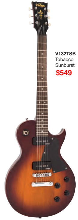
V132TSB Tobacco Sunburst $549