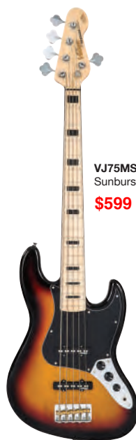
VJ75MSSB Sunburst $599