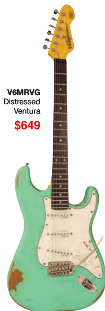
V6MRVG Distressed Ventura $649