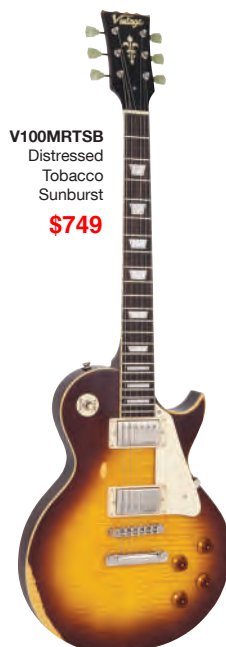
V100MRTSB Distressed Tobacco Sunburst $749