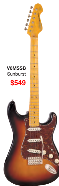
V6MSSB Sunburst $549