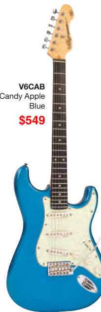
V6CAB Candy Apple Blue $549