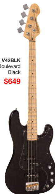
V42BLK Boulevard Black $649