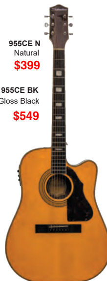
955CE N Natural $399