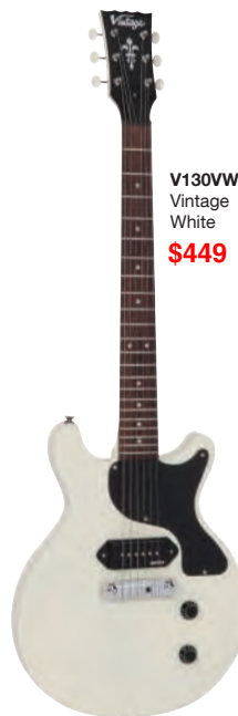
V130VW Vintage White $449