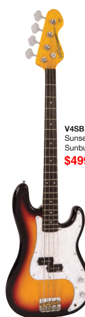
V4SB Sunset Sunburst $499