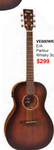
VE880WK E/A Parlour Whisky Sour $299