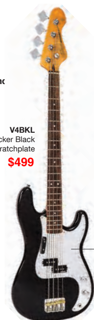
V4BKLL Rocker Black Mirror Scratchplate $499