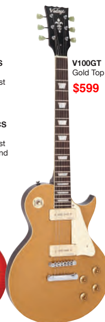
V100GT Gold Top $599