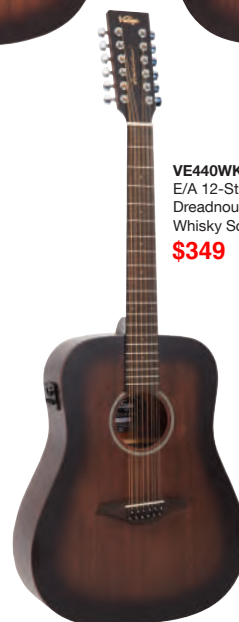
VE440WK-12 E/A 12-String Dreadnought Whisky Sour $349