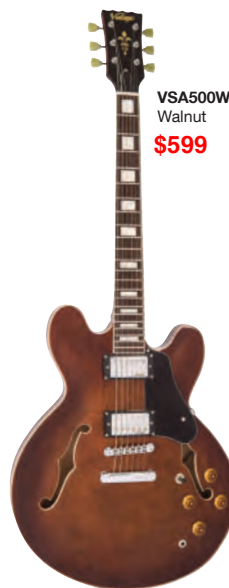
VSA500W Walnut $599