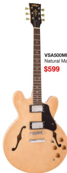
VSA500MP Natural Maple $599