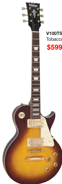
V100TSB Tobacco Sunburst $599