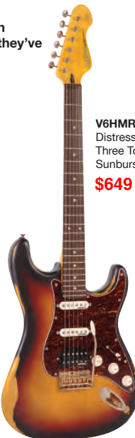
V6HMRSB Distressed Three Tone Sunburst $649