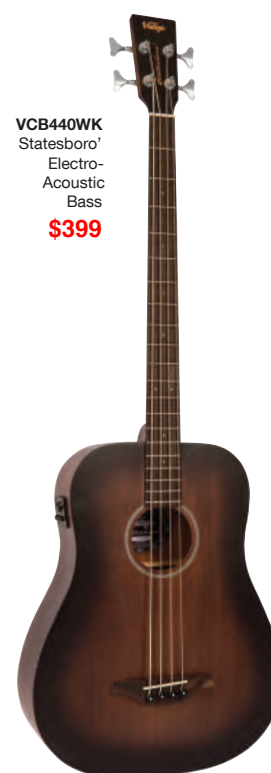
VCB440WK Statesboro' Electro- Acoustic Bass $399