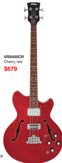
VRS450CR Cherry red $679