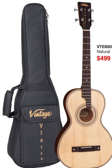
VTE800N Natural $499