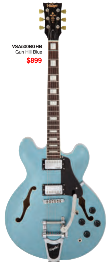
VSA500BGHB Gun Hill Blue $899