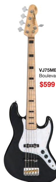
VJ75MBK Boulevard Black $599