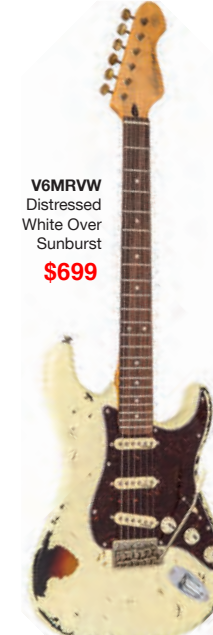
V6MRVW Distressed White Over Sunburst $699