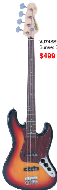
VJ74SSB Sunset Sunburst