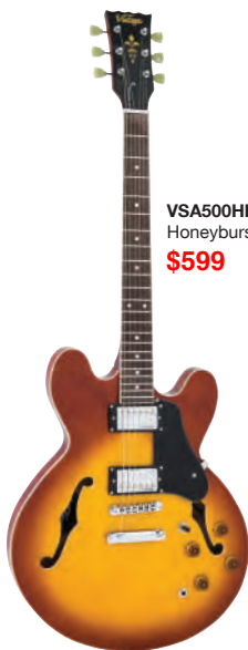
VSA500HB Honeyburst $599