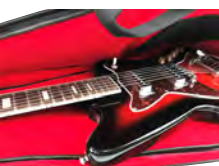
SCGB1 BK Electric Guitar $69