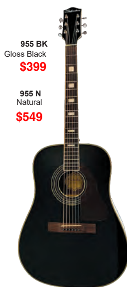
955 BK Gloss Black $399

The Silvertone Tour Series guitars are built for the touring and gigging professional. With a solid Engelmann spruce top and Rosewood back and sides, these guitars will deliver great tone at an affordable price. All models feature a modern neck taper for added comfort. The acoustic electric versions include the high-performance Fishman Clearwave™ 60 EQ/preamp with built-in tuner. At a stadium or theater, a place of worship or a local night club, the Silvertone Tour Series acoustics are ready for your next performance!