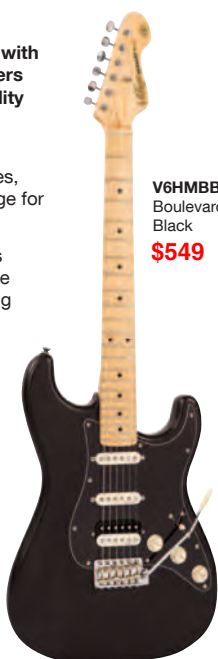
V6HMBB Boulevard Black $549