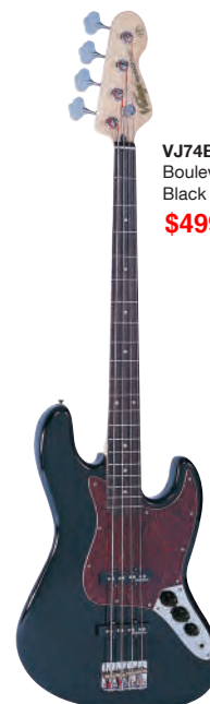
VJ74BLK Boulevard Black