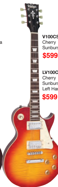
V100CS Cherry Sunburst $599