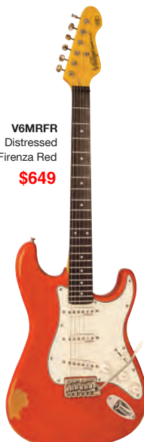
V6MRFR Distressed Firenze Red $649