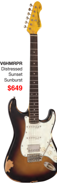
V6HMRPR Distressed Sunset Sunburst $649