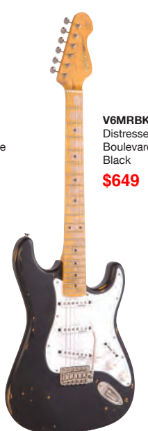
V6MRBK Distressed Boulevard Black $649