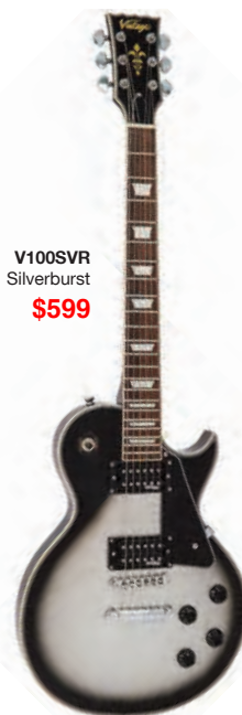
V100SVR Silverburst $599