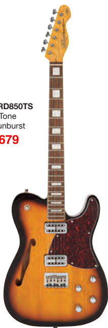
VRD850TS 2 Tone Sunburst $679