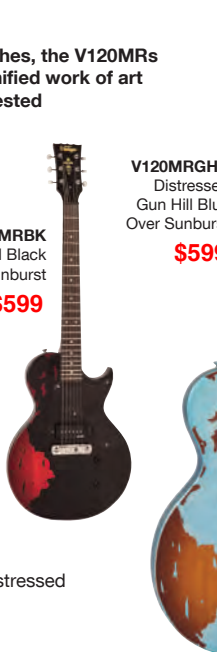
V120MRBK Distressed Black Over Sunburst $599