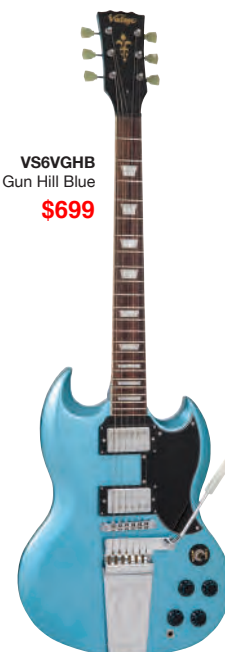
VS6VGHG Gun Hill Blue $699