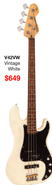
V42VW Vintage White $649