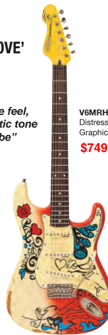
V6MRHDX Distressed Graphic $749

"Classic vintage feel, awesome authentic tone and a cool vibe"