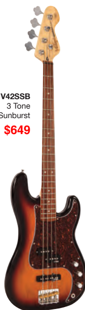
V42SSB 3 Tone Sunburst $649