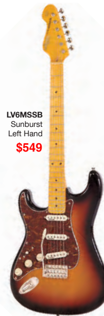
LV6MSSB Sunburst Left Hand $549