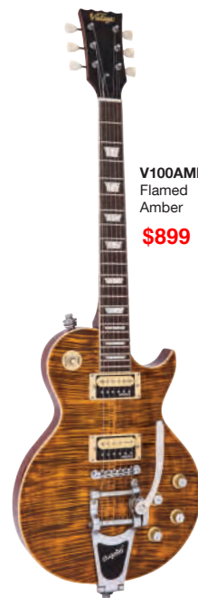
V100AMB Flamed Amber $899