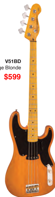
V51BD Vintage Blonde $599