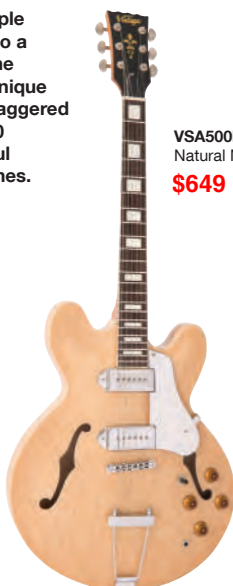
VSA500PM Natural Maple $649

With a semi-acoustic maple body perfectly matched to a set-in mahogany neck, the VSA500 also features a unique offset heel design and staggered cutaways with two MW90 pickups, offering powerful and unique single coil tones.