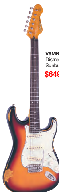
V6MRSSB Distressed Sunburst $649