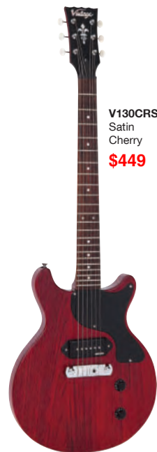
V130CRS Satin Cherry $449