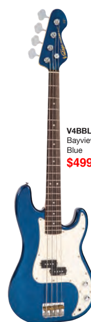
V4BBL Bayview Blue $499