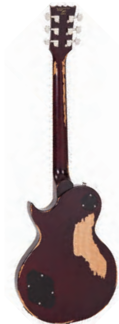
V100MRPGM Lemon Drop $799