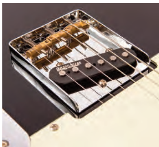
V75BK Boulevard Black