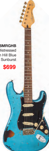
V6MRGHB Distressed Gun Hill Blue Over Sunburst $699