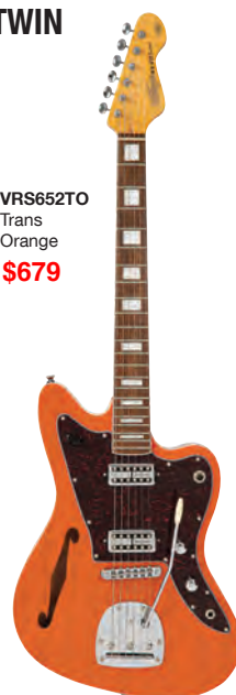
VRS652TO Trans Orange $679