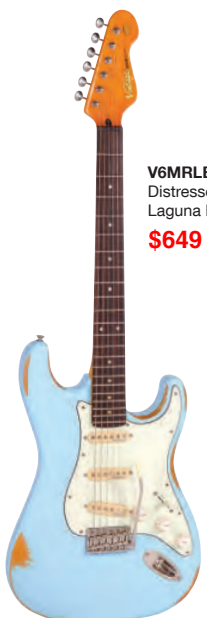
V6MRLB Distressed Laguna Blue $649