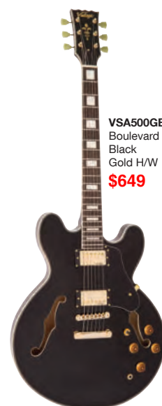
VSA500GBK Boulevard Black Gold H/W $649