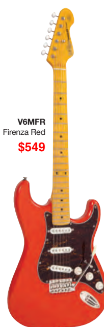
V6MFR Firenze Red $549