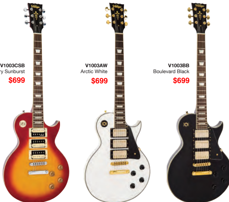
V1003BB Boulevard Black $699