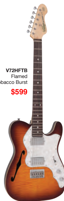
V72HFTB Flamed Tobacco Burst $599

The traditional hardtail configuration, with its six saddle strings thru-body, direct mount bridge adds an additional layer of tonality, power and dynamics to the Wilkinson WHHB with their harmonically rich tone, tight lower frequency response and controlled highs.