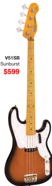
V51SB 2 Tone Sunburst $599