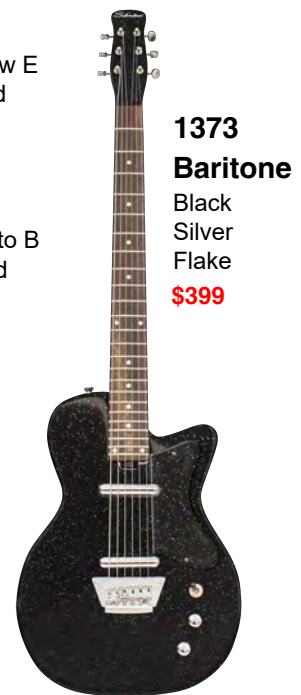
1373 Baritone Black Silver Flake $399