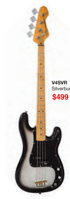
V4SVR Silverburst $499