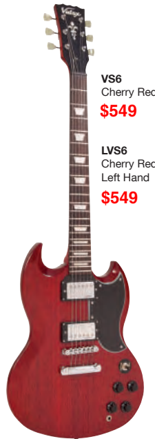
VS6 Cherry Red $549