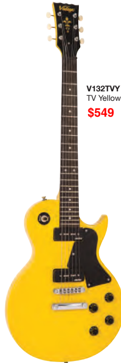
V132TVY TV Yellow $549