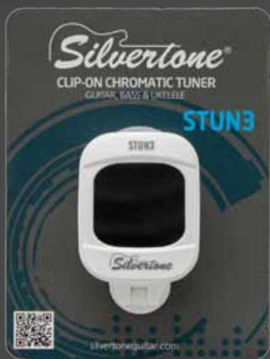
STUN3 WH White

Keep your guitar in perfect tune with a Silvertone Chromatic tuner. The durable tuner clip stays put and easily handles noisy environments. The backlit LCD display is easy to read and the virtual needle indicates how close to pitch the note is.