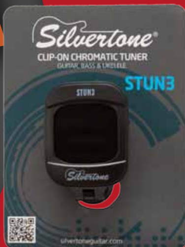
STUN3 BK Black