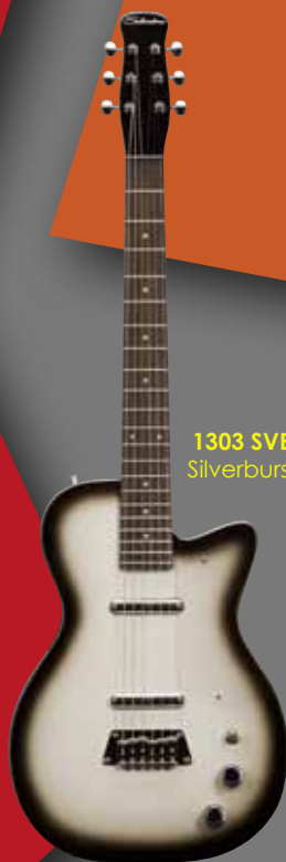
1303 SVB Silverburst