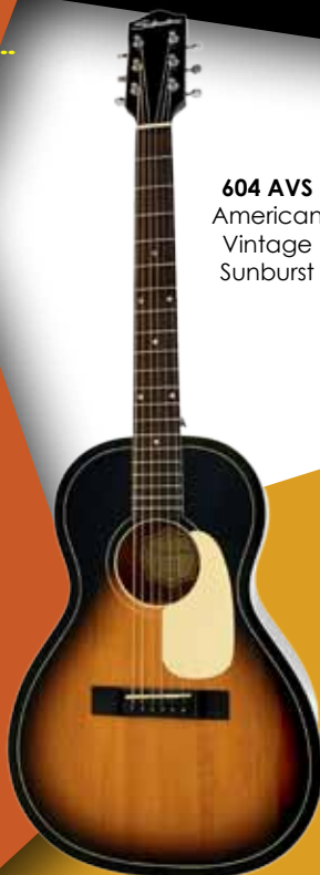
604 AVS American Vintage Sunburst

Hailing back to the year 1961, the Silvertone 604 was a student guitar for an entire generation. But, times change, and we liked the 604 so much that we 'upped the ante' so to speak, and took the 604 from a student level guitar to a serious player's instrument. We changed the old 'hard wood' body to a solid Engelmann Spruce top with Mahogany back and sides, and opted for real Rosewood vs. an 'Ebonized' fingerboard. The small Parlor size body makes it the perfect travel guitar, and yes, there is a version (the 604E) with onboard electronics.