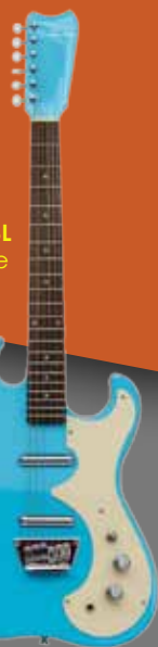
1449 DBL Daphne Blue