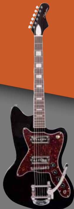
1478 BK Gloss Black