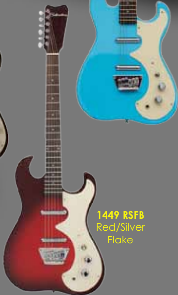
1449 RSFB Red/Silver Flake