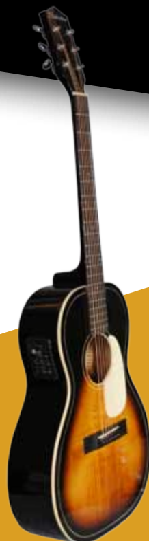
604E AVS American Vintage Sunburst