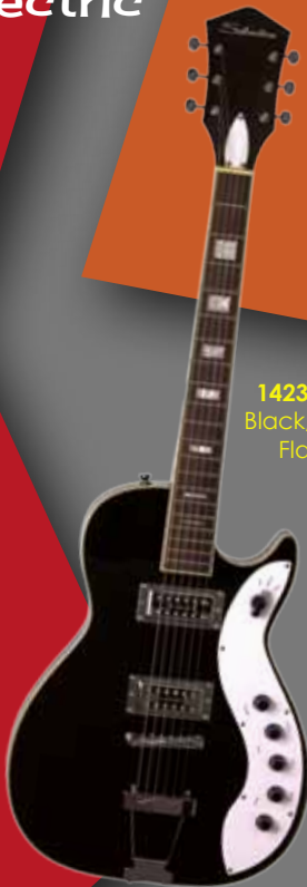
1423 BGF Black/Gold Flake