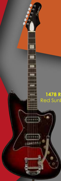
1478 RSB Red Sunburst

Originally offered in 1963, the Silvertone 1478 was an instant favorite. The offset double cutaway body is made of solid Mahogany with a maple top, for a deep rich tone with top end bite. The genuine Bigsby® tremolo and adjustable steel bridge mean faultless intonation and better string attack – an improvement over the rosewood bridge and antiquated tremolo system on the original. We also paid special attention to the neck profile, improving it with a modern C-shape, as well as coupling it to the body with a newly engineered neck joint system for longer sustaining notes. This reissue is the real deal.