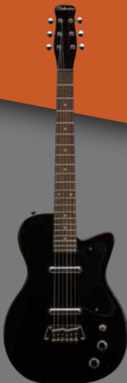
1303 BK Gloss Black