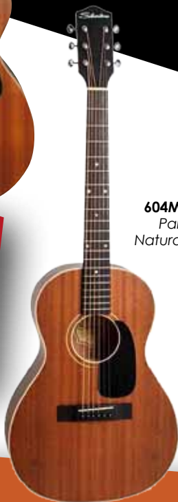
604MH NS Parlor Natural Satin