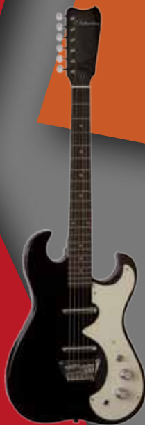
1449 BSF Black/Silver Flake