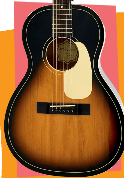
604 AVS American Vintage Sunburst