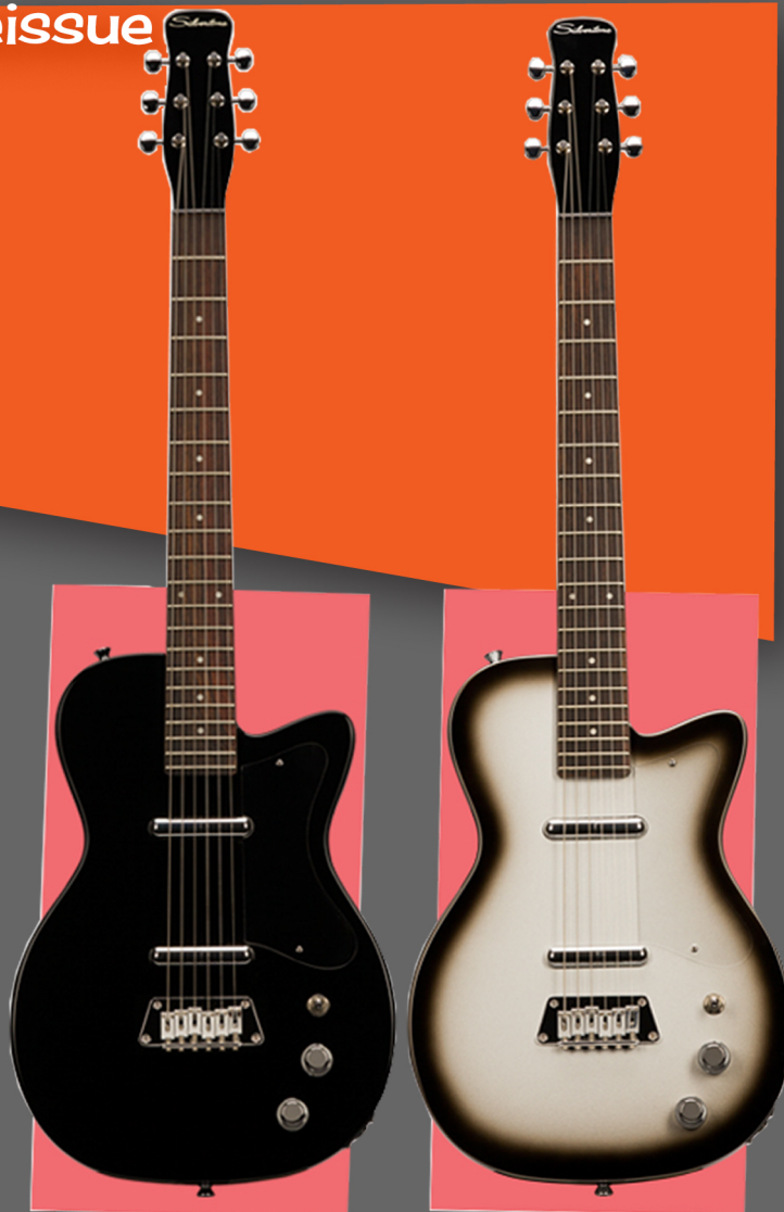
1303 BK Gloss Black

Tuners - Sealed Finish - Chrome Bridge - Thru-body adjustable