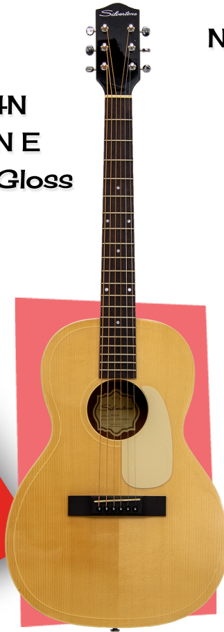
604N 604N E Natural Gloss