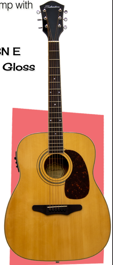
633N E Natural Gloss