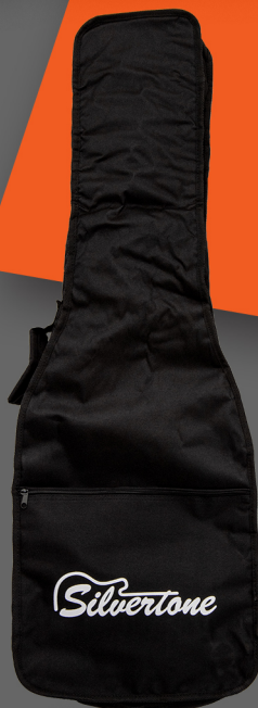
SBEG5 Black Fits all Silvertone Electrics