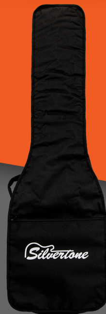
SBEB5 Black Fits most Electric Basses