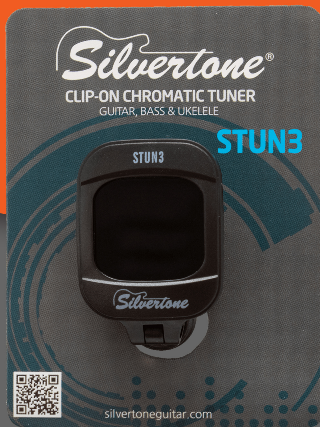
STUN3 BK Black

Keep your guitar in perfect tune with a Silvertone Chromatic tuner. The durable tuner clip stays put and easily handles noisy environments. The backlit LCD display is easy to read and the virtual needle indicates how close to pitch the note is.