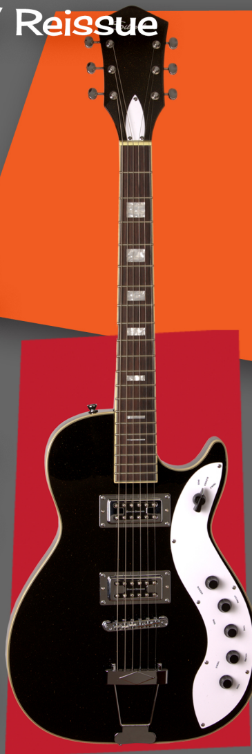
1423 BGF Black Gold Flake