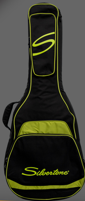
SCGB201 BK Black/Lime Fits Silvertone 604 and 600