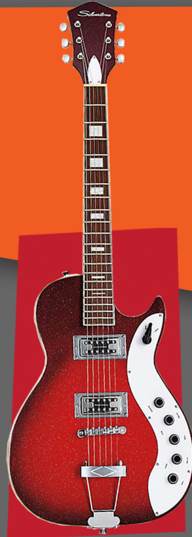
1423 RSFB Red Silver Flake Burst