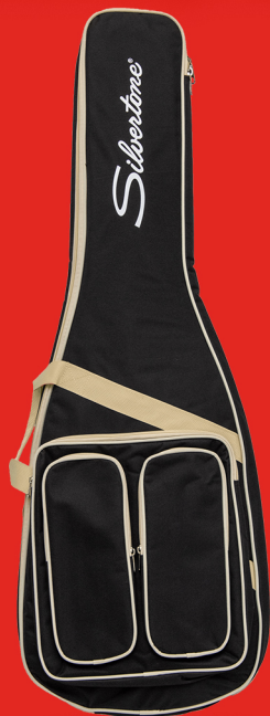
SCGB1 BK Black/Cream Fits all Silvertone Electrics

Protect your guitar with a genuine Silvertone Gigbag, keeping your guitar safe when you're on the go! We have a gigbag available for every Silvertone model guitar.