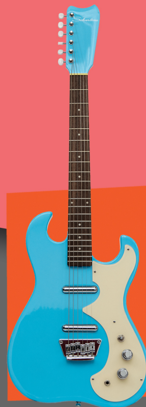
1449 DBL Daphne Blue