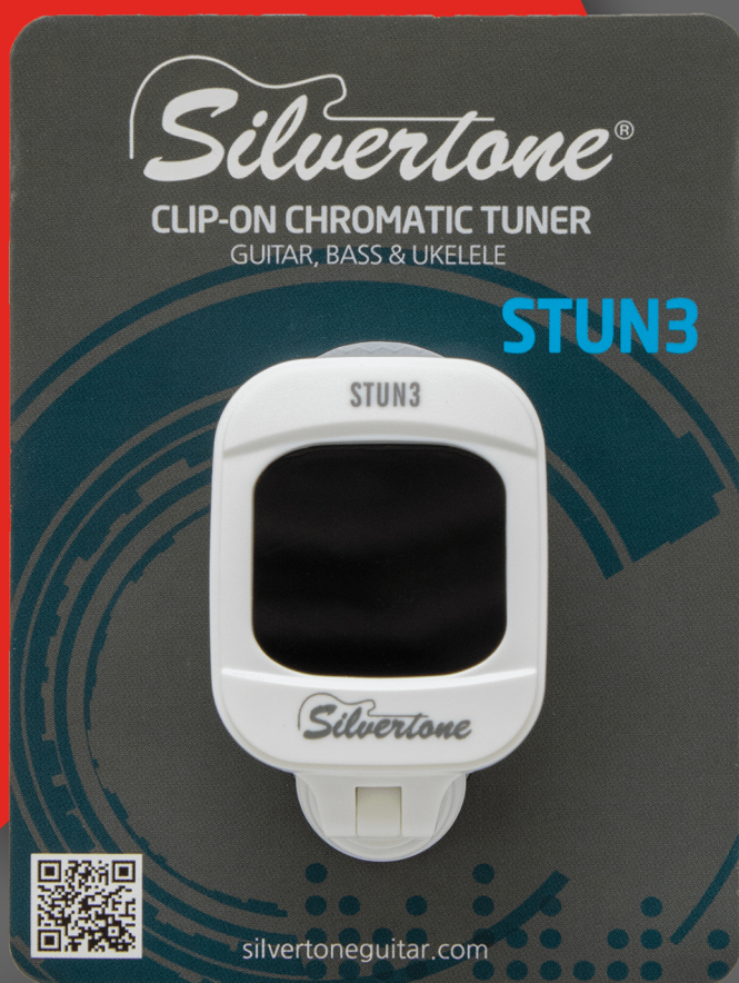
STUN3 WH Black