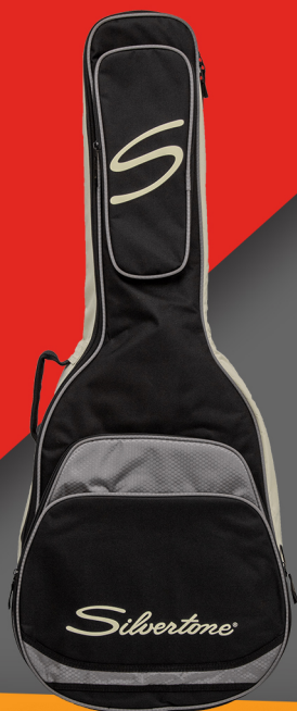
SCGB202 BW Black/Cream Fits Silvertone 633 and 955