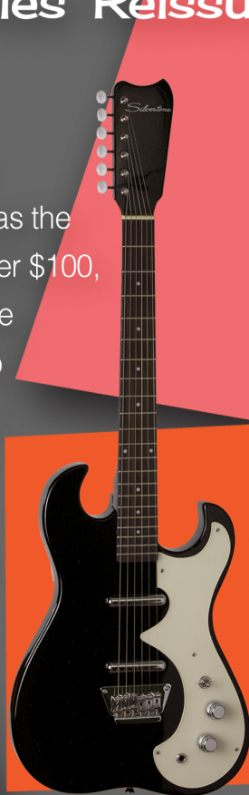
1449 BSF Black Silver Flake

Tuners – Sealed Finish – Chrome Bridge - Thru-Body Adjustable