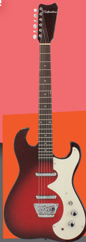
1449 RSFB Red Silver Flake Burst