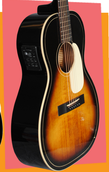
604E AVS American Vintage Sunburst