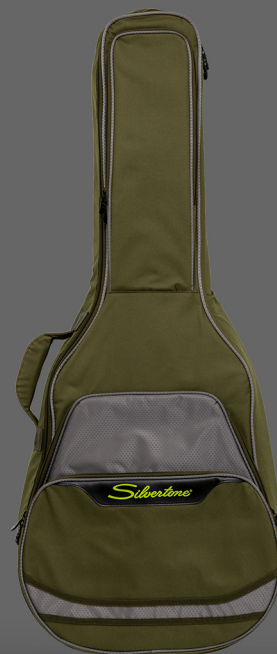
SCGB201 OG Olive Green/Grey Fits Silvertone 633 and 955