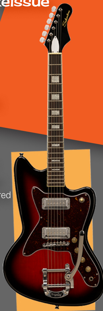
1478 RSB Red Sunburst

Tuners - Sealed Finish - Chrome Bridge - Tune-O-Matic Tailpiece - Bigsby Vibrato