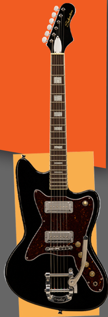
1478 BK Gloss Black