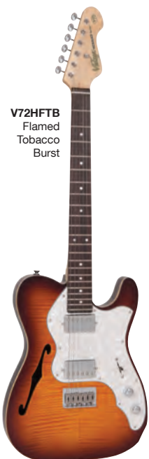
V72HFTB Flamed Tobacco Burst

The traditional hardtail configuration, with its six saddle strings thru-body, direct mount bridge adds an additional layer of tonality, power and dynamics to the Wilkinson WHHB with their harmonically rich tone, tight lower frequency response and controlled highs.