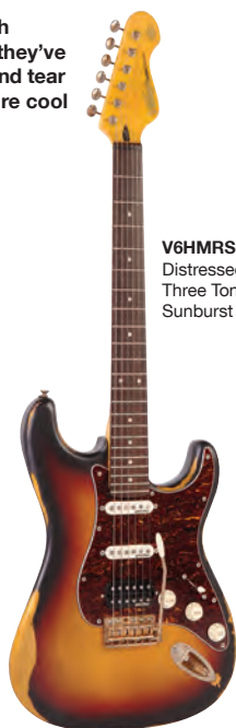
V6HMRSB Distressed Three Tone Sunburst