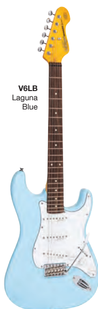
V6LB Laguna Blue