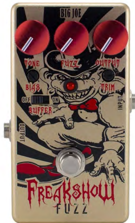
B-313 - Germanium