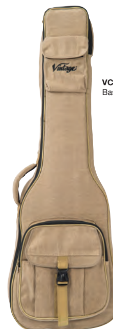
VCBG2 Bass Bag