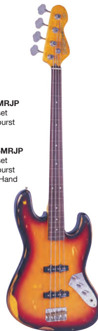
LV74MRJP Sunset Sunburst Left Hand