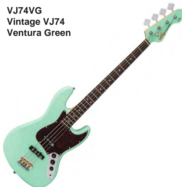
VJ74VG Vintage VJ74 Ventura Green