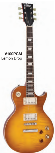
V100PGM Lemon Drop

The reverse-fitted neck double coil and out of phase centre position wiring created one of the most recognisable guitar sounds of the genre – real 'Black Magic'.