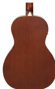
V180VSB 'Parlour' Acoustic Guitar Vintage Sunburst

With a lightweight mahogany-spruce construction, and an exceptionally smooth 20 fret fingerboard, the small bodied Vintage Historic Series Parlour electro-acoustic excels as a 'player', with a size-defying long-throw output and exceptional tone.