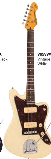
V65VWV Vintage White