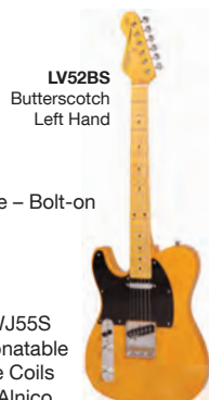
LV52BS Butterscotch Left Hand

Featuring the Wilkinson WTB Bridge this classic 3-saddle design has been around for over 50 years and is still regarded as the ultimate tone machine. Staggered brass saddles offer individual string intonation never before available in a design of this type. The baseplate itself is a faithful reproduction of the original, made from steel, very important in a bridge of this style due to the tonal effect it has on the magnetic field of the pickup mounted in it.