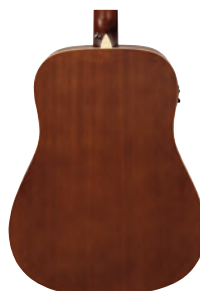
V140VSB 'Dreadnought' Acoustic Guitar Vintage Sunburst

Whilst the Dreadnought's theme is indeed punch, power and big sounding chords, it's equally at home as an exceptional fingerpicking guitar, and perfect a host of styles including acoustic rock, blues, folk bluegrass and country.