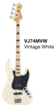
VJ74MVW Vintage White