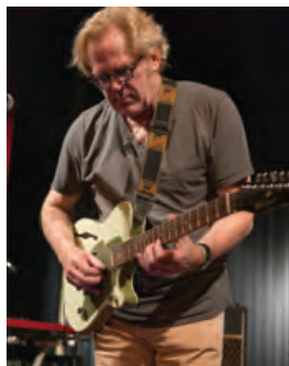
FKV25JJ Arcadia Green

A matched, calibrated set of Wilkinson pickups are coupled with two auxiliary 'ghost' coils under the elegantly designed scratch plate, providing both hum-cancelling and classic single coil tones at the turn of a dial, thanks to the unique 'Vari-coil' control.