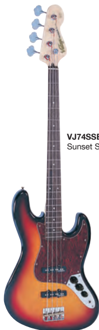
VJ74SSB Sunset Sunburst

An Ash body finished in Gloss Black or Sunset Sunburst is matched to a hard maple neck and the fingerboard has traditional dot markers.