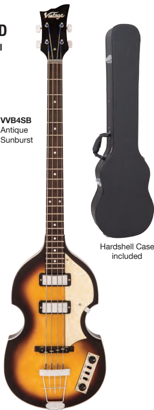
Hardshell Case included