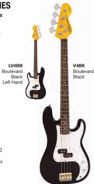
LV4BB Boulevard Black Left Hand

Classic split single coil tones abound with the V4 bass. Its Alder body gives a firm foundation for the Wilkinson adjustable bridge and is perfectly matched to a hard maple neck.