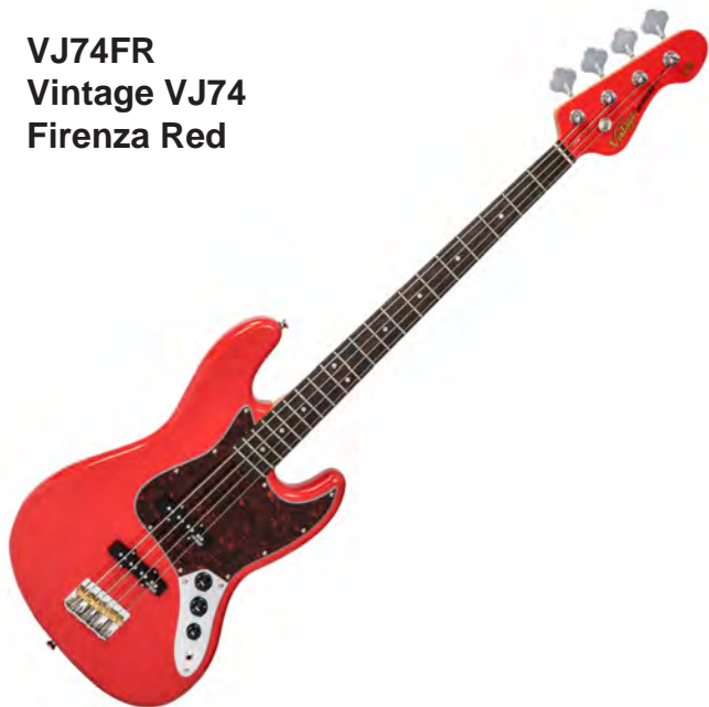
VJ74FR Vintage VJ74 Firenza Red