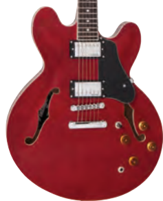
LVSA500CR Left Hand Cherry Red