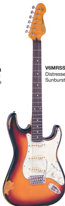
V6MRSSB Distressed Sunburst