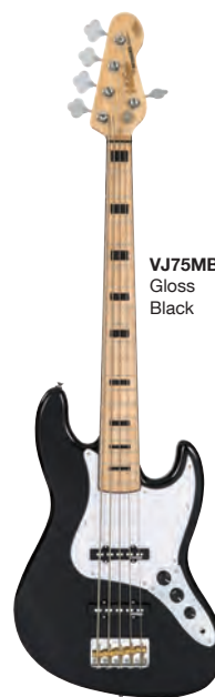
VJ75MBK Gloss Black