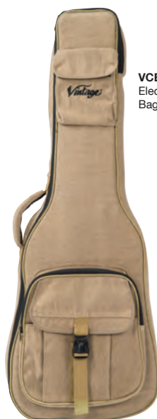
VCEG1 Electric Bag

Your guitars are too valuable to risk on the road. Travel safely, and always in style, with the Vintage range of carry bags.