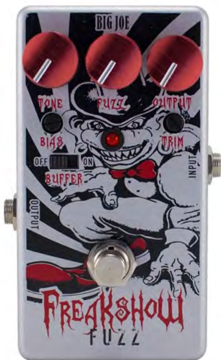
B-312 - Silicone