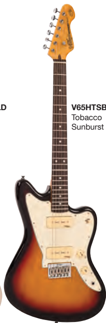
V65HTSB Tobacco Sunburst