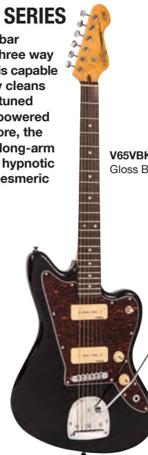
V65VBK Gloss Black