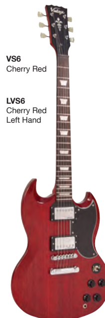
LVS6 Cherry Red Left Hand