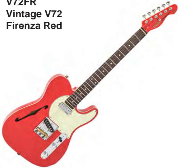
V72FR Vintage V72 Firenza Red