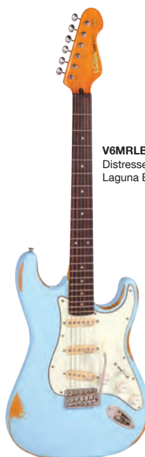
V6MRLB Distressed Laguna Blue