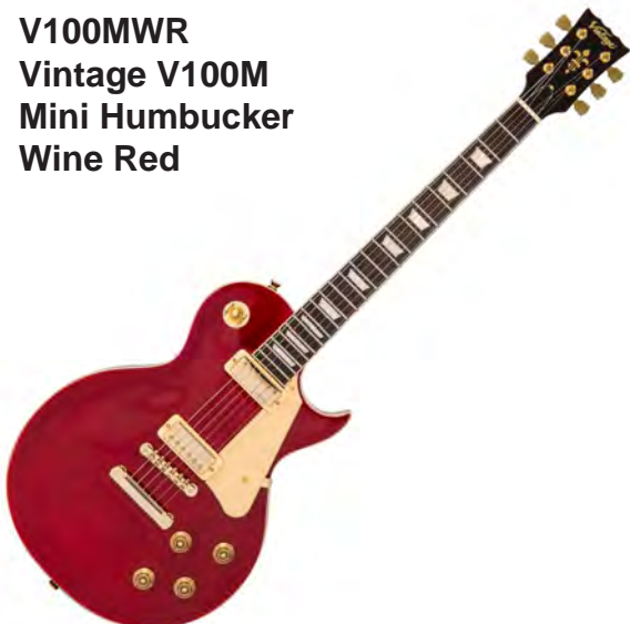
V100MWR Vintage V100M Mini Humbucker Wine Red