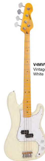
V4MVW Vintage White