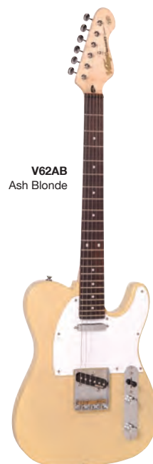
V62AB Ash Blonde