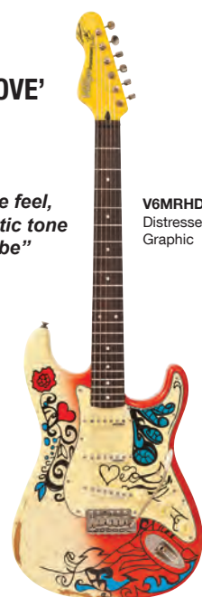
V6MRHDX Distressed Graphic