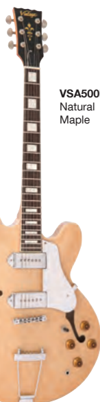
VSA500PM Natural Maple

With a semi-acoustic maple body perfectly matched to a set-in mahogany neck, the VSA500 also features a unique offset heel design and staggered cutaways with two MW90 pickups, offering powerful and unique single coil tones.