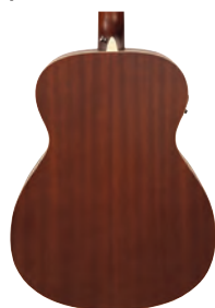
V160VSB 'Orchestral' Acoustic Guitar Vintage Sunburst

With its small waste and larger bouts, the Vintage Historic Series Orchestra acoustic and electro-acoustic guitar, is the halfway house body size between the parlour and dreadnought, with an intimate feel in the playing position and very popular with players seeking solid low frequencies, punctuated mids and sweet highs.