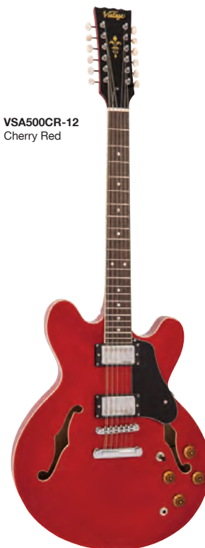
VSA500CR-12 Cherry Red

The VSA535-12 offers huge tonal interest to fans of that gorgeous ringing 12-string jangle, with that so-distinctive lush and resonant ring – this guitar sounds like an orchestra on its own!