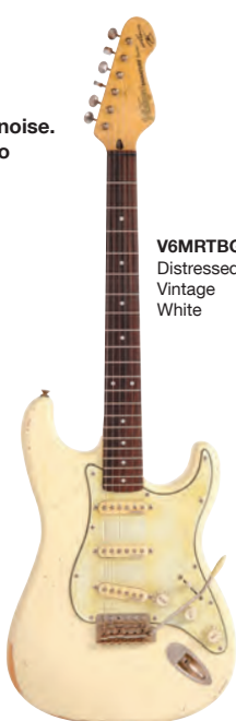
V6MRTBG Distressed Vintage White