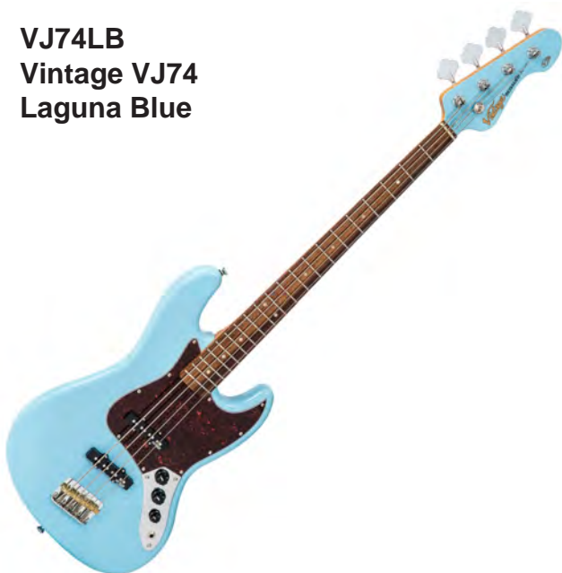
VJ74LB Vintage VJ74 Laguna Blue