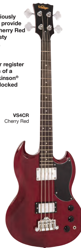
VS4CR Cherry Red

The instrument's bass response and lower register harmonics are maximised by the inclusion of a GraphTech NuBone nut, while a set of Wilkinson® WJL200 machine heads keep your tuning locked in for the night.