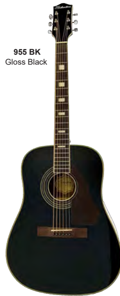
955 BK Gloss Black

The Silvertone Tour Series guitars are built for the touring and gigging professional. With a solid Engelmann spruce top and Rosewood back and sides, these guitars will deliver great tone at an affordable price. All models feature a modern neck taper for added comfort. The acoustic electric versions include the high-performance Fishman Clearwave™ 60 EQ/preamp with built-in tuner. At a stadium or theater, a place of worship or a local night club, the Silvertone Tour Series acoustics are ready for your next performance!