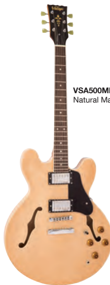
VSA500MP Natural Maple