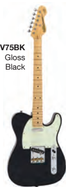
V75BK Gloss Black