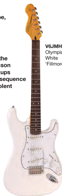
V6JMH Olympia White 'Fillmore'