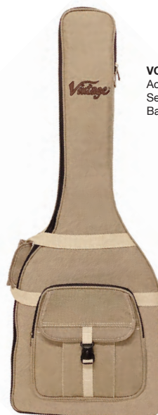
VCAG3 Acoustic/ Semi-Acoustic Bag