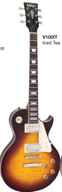
V100IT Iced Tea