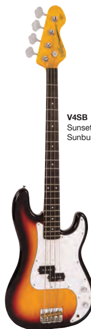
V4SB Sunset Sunburst