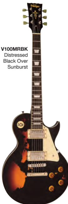
V100MRBK Distressed Black Over Sunburst