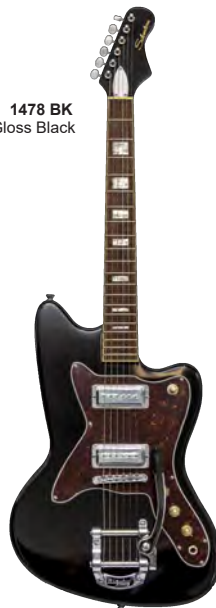
1478 BK Gloss Black