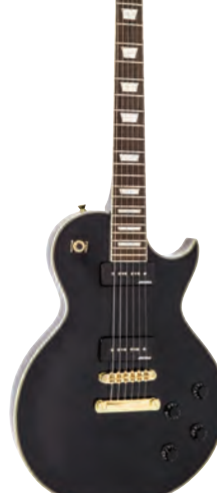
V100PBB Gloss Black

The V100PBB offers an appealing alternative to the regular V100. Equipped with a pair of Wilkinson® W90 SK Black pickups, the V100PBB is as reassuringly weighty as its stablemates, but offers a pleasant tonal twist, courtesy of its pickup set. Defined lows, throaty mids and transparent highs are all part of the package, whilst gold Wilkinson® hardware ensures that the V100PBB looks every bit as classy as it sounds.