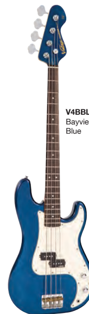
V4BBL Bayview Blue