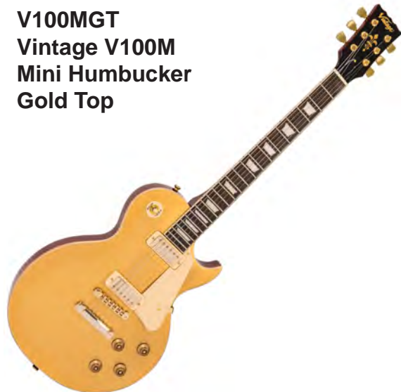
V100MGT Vintage V100M Mini Humbucker Gold Top