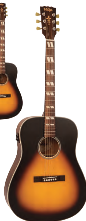
VE140VSB 'Dreadnought' Electro-Acoustic Guitar Vintage Sunburst