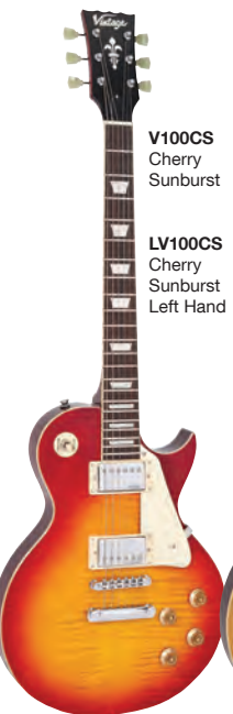
V100CS Cherry Sunburst