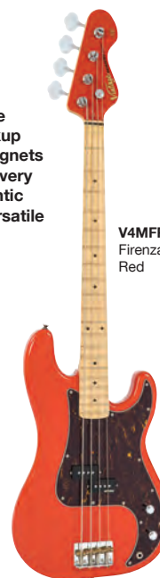
V4MFR Firenza Red