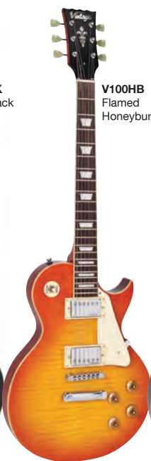
V100HB Flamed Honeyburst