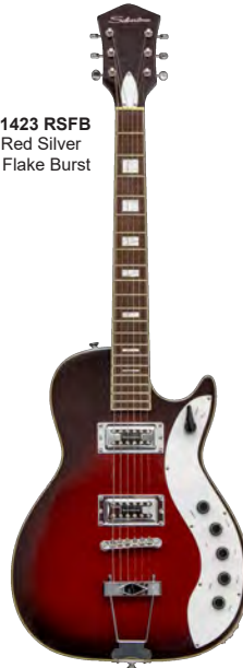
1423 RSFB Red Silver Flake Burst