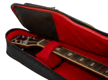
SCGB1 BK Electric Guitar

Protect your guitar in style with a genuine Silvertone gigbag, keeping your guitar safe when you're on the go! We have a gigbag available for every Silvertone guitar model.