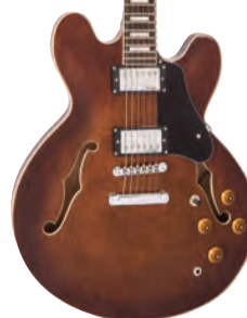
LVSA500W Left Hand Walnut