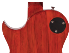
V100TWR Flamed Trans Wine Red

Incorporating a solid mahogany body with mahogany set-neck – complete with ingenious offset-neck design for superb upper fret access.