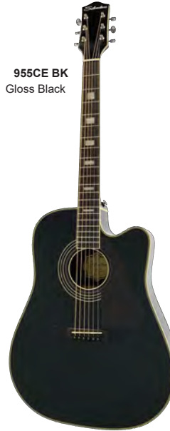
955CE BK Gloss Black