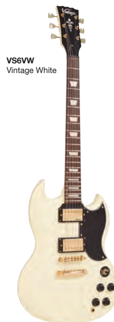
VS6VW Vintage White