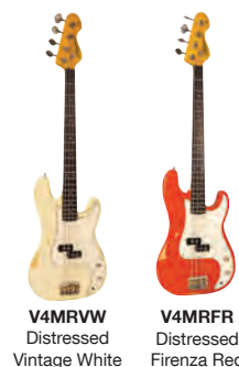
V4MRVW Distressed Vintage White