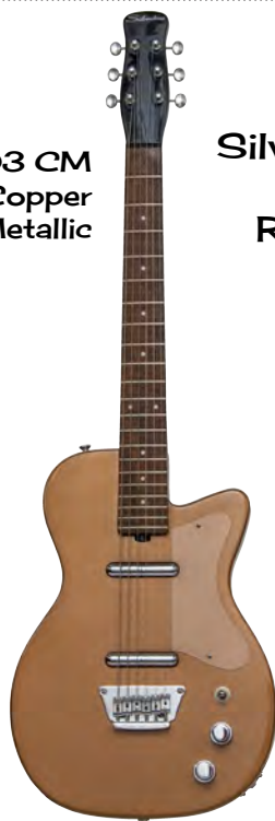
1303 CM Copper Metallic