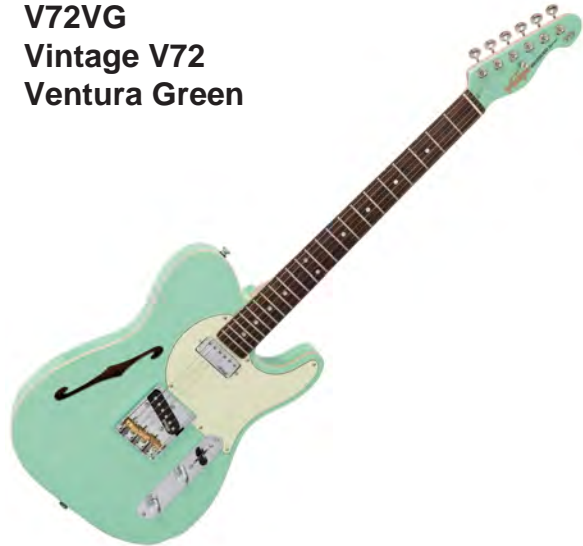
V72VG Vintage V72 Ventura Green