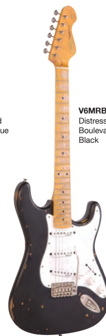
V6MRBK Distressed Boulevard Black