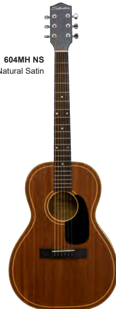
604MH NS Natural Satin

Prized for its resonant warm tone, mahogany top guitars have long been a favorite of songwriters. The woody open sound blends perfectly with vocals without overpowering them. The Silvertone 604MH and 600MH feature a beautiful striped mahogany top and back. These guitars just might inspire your next big hit single!