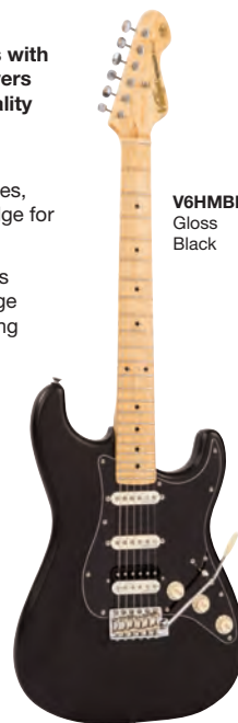
V6HMBB Gloss Black