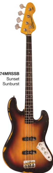
V74MRSSB Sunset Sunburst

A Vintage ICON Series Bass already looks like your lifetime companion; the best part is your journey is just beginning. Play on.