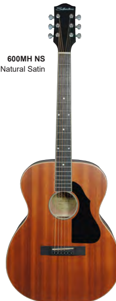
600MH NS Natural Satin