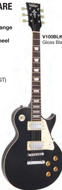
V100BLK Gloss Black