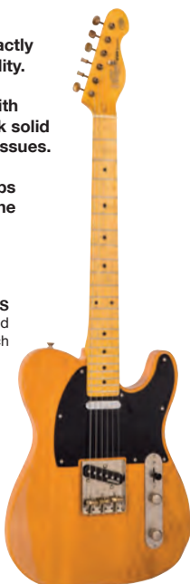
V52MRBS Distressed Butterscotch

A pair of calibrated and matched Wilkinson pickups effortlessly capture all those iconic sounds, and the one piece hard maple neck and fingerboard gives easy access across the fretboard.