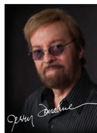
V58JDAB Ash Blonde