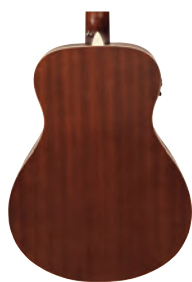
V130VSB 'Folk' Acoustic Guitar Vintage Sunburst

With a similar body shape and size to a classical guitar, the Vintage Historic Series Folk electro-acoustic guitar adds sparkle and character to chords and solo note runs, with exceptional lows, mids and soaring highs and all the charm, playability and balanced frequencies that has made this stunning acoustic guitar a firm favourite with fingerpickers around the world.