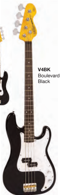
V4BK Boulevard Black