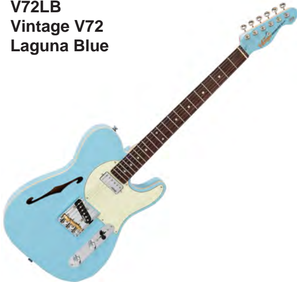
V72LB Vintage V72 Laguna Blue